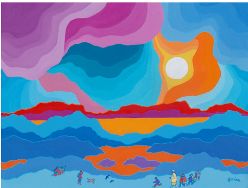
"Adventure Walk" by Ted Harrison